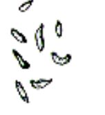
Droppings 1/4" Pointed