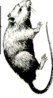
Appearance: Large, Robust Average weight: 7-18 ozs.